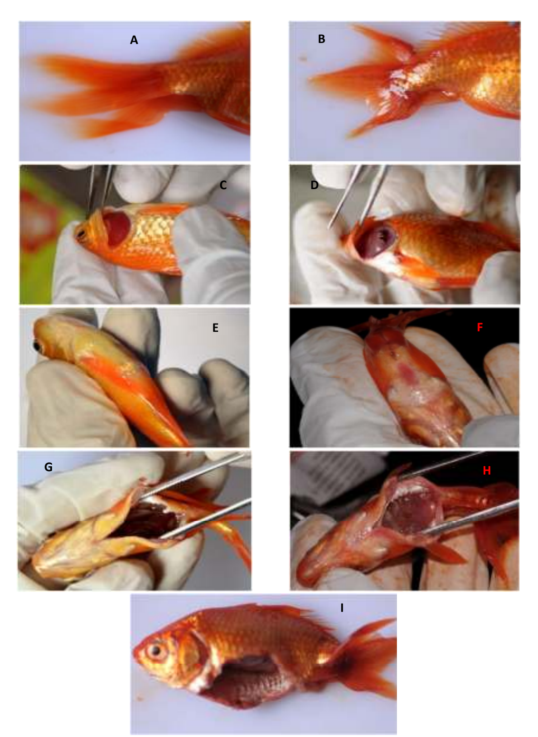
Figure 1: Comparison of control injected with PBS and experimentally infected Gold fish with Edeardsiella tarda . [A) Control fish with no symptom on the caudal fin; B) Experimentally infected goldfish with internal haemorrhage at the caudal fin; C) Control fish with healthy gills; D) Experimentally infected fish with pale coloured gills; E) Healthy fish with no symptom at the base of the pelvic fin; F) Experimentally infected goldfish with haemorrhagic patches at the base of the pelvic fin; G) Control fish with no symptom in the internal organs; H) Experimentally