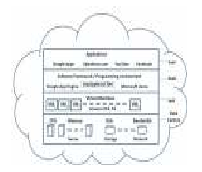
Figure 1. High Level View of Cloud Computing Architecture

The developers to concentrate on the business value rather on the starting budget. The clients of commercial clouds rent computing power (virtual machines) or storage space (virtual space) dynamically, according to the needs of their business. With the exploit of this technology, users can access heavy applications via lightweight portable devices such as mobile phones, PCs and PDAs. Amazon, Google, Yahoo! and Salesforce.com. This makes it possible for new startups to enter the market easier, since the cost of the infrastructure is greatly diminished.