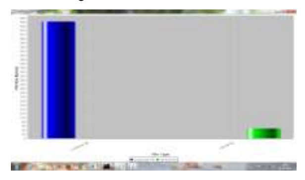
Fig: 3 Compression Chart