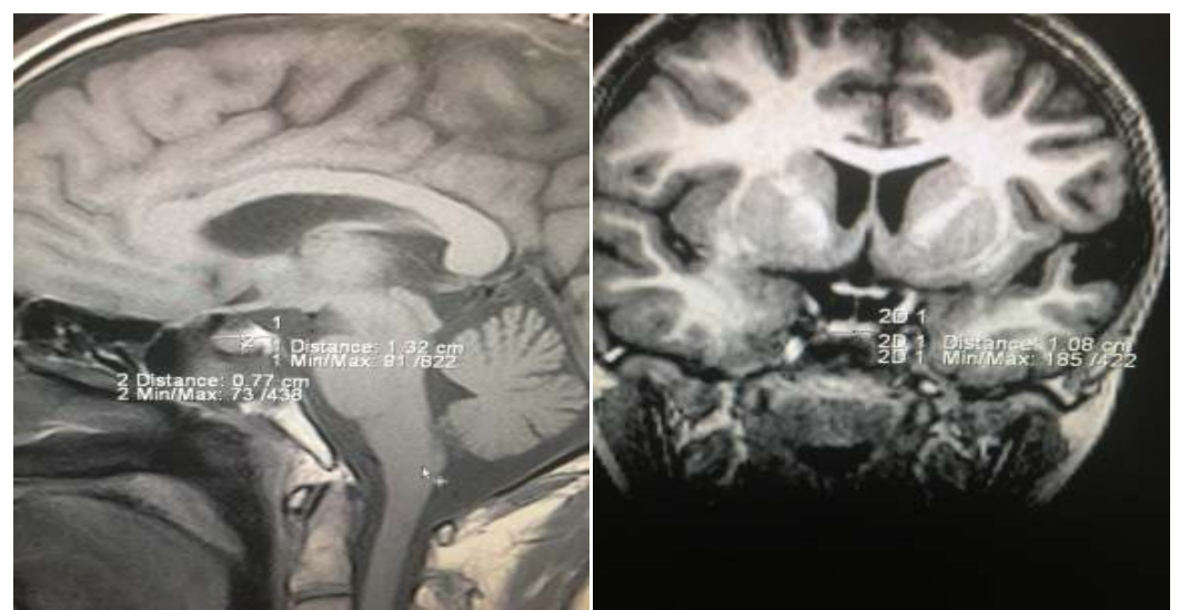
Figure 1a & 1b: Midline sagittal and coronal T1 weighted images showing height AP dimension and transverse dimension of pituitary gland in a 52 year old female with height of 7.7 mm

Mean and Standard deviations of pituitary height were calculated in the scale of mm. Volume in different age groups were calculated in the scale of mm3. Relation between mean height and age and relation between volume and age were done by ANOVA test, Chi-square test and p-value <0.05 was considered as significant.