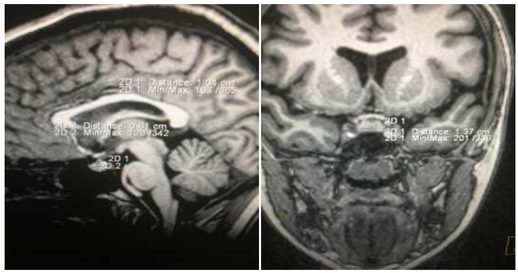
Figure 3a & 3b: Midline sagittal and coronal T1 weighted images showing various dimensions of pituitary gland in a 25 year old female with height of 8.1 mm with convex upper border

and 3b) and concave shape was seen in 14% in all age groups and both sexes.