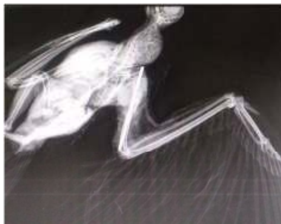
Figure 2: Radiograph after the surgical correction of the fracture

As a part of the pre – operative measure, the area of fracture was clipped, scrubbed and bandaged the rest of the wings. Prior to the surgery the area was aseptically sterilized and an antibiotic umbrella was given. An incision was made on the site of the fracture using BP blade and handle. The fractured bone was exposed. A Steinmann pin 3mm diameter was introduced through the fractured site to the distal part initially and then to the proximal part with the help of a chuck. The remaining part of the pin protruding out from the bone was cut using a pin cutter. The muscle layer was sutured using PGA 2-0, continuous suture pattern and the skin sutured using interrupted suture pattern using hylon. A padding of Staphban ointment was applied and bandaged the area. Radiograph after the surgical correction showed correct alignment. (Figure 2)