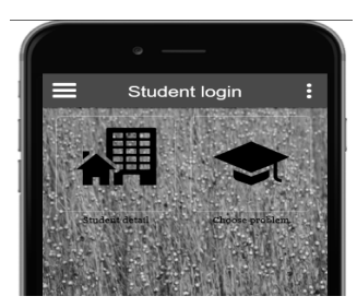
Fig. 2 Student login screen

Step 7: Once the primary feature is functioning better, add the remaining additional features.