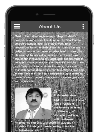
Fig. 4 Introduction screen