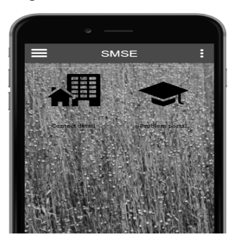
Fig. 6 Industry login screen