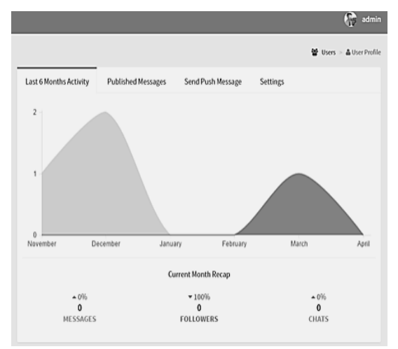
Fig. 3 App usage statistics screen

Front end of the app assist the user to enter the details as shown in figure 2,4 and 6. Back end process the business logic and data. Mobile app transactions are recorded in the mobile app log as shown in figure 3.