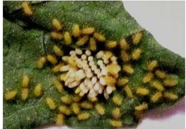
Figure 2: Newly hatched 1 st instar

branched spines on the back. At first the spines are yellow, but later become darkened on the tips, and thus more conspicuous. Larva molts four times during the development. Mature larva is approximately 6.0-7mm in length. The average duration of the 1 st , 2 nd , 3 rd and 4 th instar was recorded as 2.5 \pm 1.17 days, 4.5 \pm 1.92 days, 5.5 \pm 2.86 days and 5 \pm 2.23 days respectively. During their earlier stages the grubs are gregarious in nature but as they grow older they tend to split into smaller groups (figure 2 & 3).