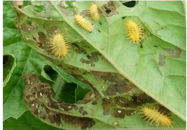
Figure 3: Later stage instar grubs