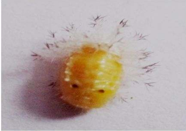
Figure 4: Pupa

bodies, to the underside of the leaves or stem. Larvae pupate in this position. During pupation the larval skin is pushed backwards from the thorax towards the abdomen, where it remains as a whitish, wrinkled mass. It ceases its motion and pupates. Pupa is yellow, spineless, and of the same size and shape as of the adult. The pupal period lasts for 3-5 days with an average of 4 \pm 0.79 days. Similar results were obtained by Verma and Anandhi (2008) and Qamar et al. , (2009) figure 4.