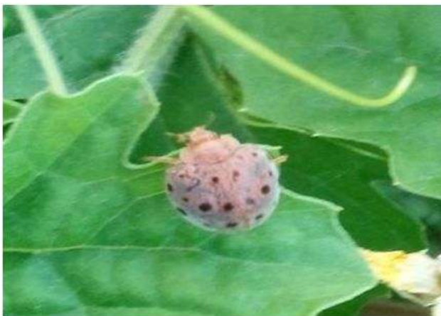
Figure 5: Adult Hadda beetle

The adult is oval in outline, about 6-7mm in length. Newly emerged adult is straw or cream-yellow in color and shortly after emergence, 28 black spots of variable size appear on the dorsal side. The whole body is covered with fine short hairs. Adults darken with age and finally attain orange brown color with a bronze tinge. Adult males are slightly smaller in size than adult females (figure 5).