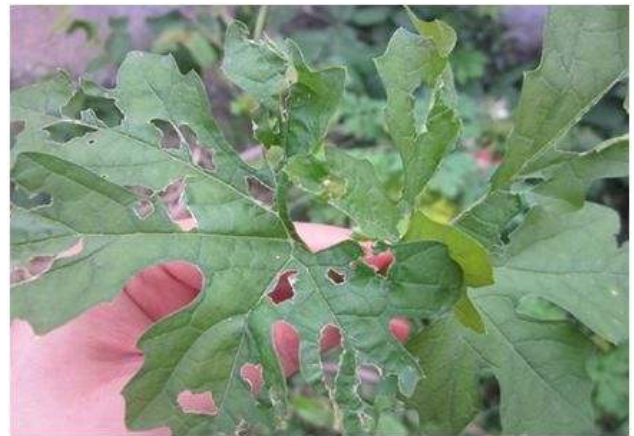
Figure 6: Damage pattern of Henosepilachna vigintioctopunctata on bitter gourd leaves

The affected leaves become translucent, take a grayish color and dry up. In cases of severe attack, the young plant can dry up completely and die. Adults are fliers can damage large crop areas during their peak activity (Nagia et al. 1992). The adults are not responsible for as great level of injury as are the larvae (figure 6).