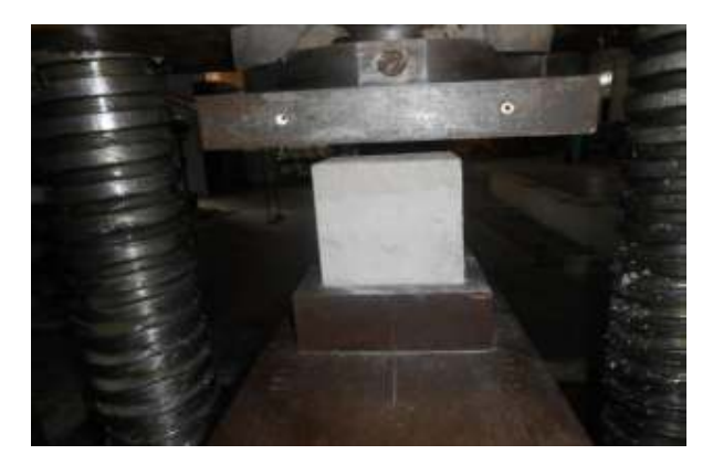
Compression Testing Machine