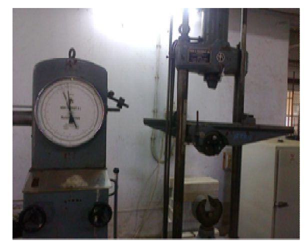
Flexural testing machine

pure concrete, the augmented percentages of polypropylene hybrid fiber-reinforced concrete are 12%, 15%, and 20%. When the load put on the beams, the hybrid fibers can withstand the tensile stress in the tensile zone below the neutral axis. When fine staple fibers fail, coarse monofilament fibers can keep bridging and disperse the stress of macro cracks until they cannot sustain. Therefore, hybrid fiber-reinforced concrete has higher MOR. Because the fibers have high elastic modulus and stiffness, the major parts of fibers are pulled out. This fracture model is similar to steel fiber on concrete.