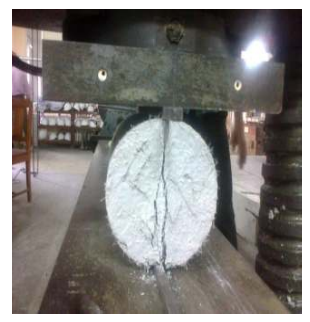
Split tensile strength test

The increase of splitting tensile strength of Polypropylene hybrid & glass fiber concrete Compared with the pure concrete, as the fiber content increases, the splitting tensile strength of polypropylene hybrid fiber-reinforced concrete rises by 5%, 6%,8% respectively. Also, the hybrid fiber reinforced concrete increases more splitting tensile strength than the single fiber-reinforced concrete does. In primary stage of cracking of concrete, there are numerous fibers bridging the micro cracks and preventing the expansion. When the tensile stress kept ruins the specimens, the stress was transferred to the monofilament fibers, which are coarser and stronger, so it can arrest the propagating macro cracks and substantially improve the splitting tensile strength.