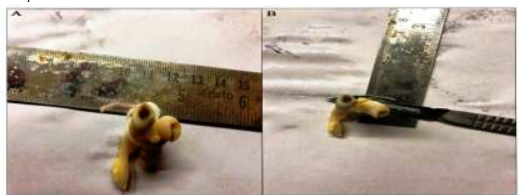
Figure 3: (A) Photograph showing cut appendix at maximum dilatation of lumen by fecolith, (B) Photograph showing section taken at area adjacent to mximum dilatation

An age wise distribution of cases (SSA) showed that all patients of were adults in age group of 32-50 years, with male to female ratio being 4.5:1