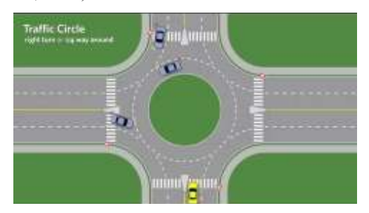
Fig. 4 Typical Example of Traffic Circle

shape, measuring between 5 m and 7 m in diameter, and can include landscaping within the circle. Traffic circles prevent drivers from speeding through intersections by blocking the through movement. They are most effective when there is a vertical landscaping design in the center, since it increases its visibility to the drivers and provides aesthetics to the neighborhood. Traffic circles are more suitable for intersections of local streets without high pedestrian or left-turn traffic volumes (CCL, 2014; PennDoT, 2001).