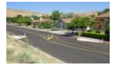
Fig. 3 Typical Example of Lateral Shifts

Lateral Shifts presented in Figure are half of a chicane. To cause travel lanes to bend one way and then bend back to the original direction of travel are implemented on the street curb extensions or pavement markings. It's typically used to slow vehicles down by forcing drivers to maneuver through the bend. They can be used on collectors or even arterials, when implemented with the right degree of deflection. Lateral shifts can be considered when high traffic volumes and high speed limits prevent the use of other traffic calming measures (CCL, 2014).