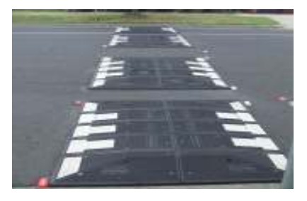
Fig 7 Typical Example of Speed Cushion

and range in length from 2 to 3 m. Passenger vehicles cross the speed cushions in the same way as speed humps, while emergency vehicles are able to drive through the measure without having to step over it, due to their wider wheel track. Thus, emergency services response times are not affected as much, if at all.