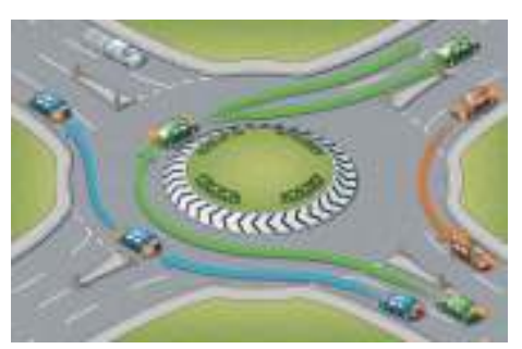
Fig. 5 Typical Example Roundabout

Roundabout is a measure similar to the traffic circle, but they are larger and typically require additional right-ofway for the vehicles circulating on it. The central island diameter of a single lane roundabout can measure between 17 and 33.5 m. As Figure 5 indicates, raised splitter islands are need at roundabouts to channel approaching traffic to the right. They are found primarily on arterial and collector streets, often substituting intersections that were controlled by traffic signals or stop signs (CCL, 2014; PennDoT, 2001).