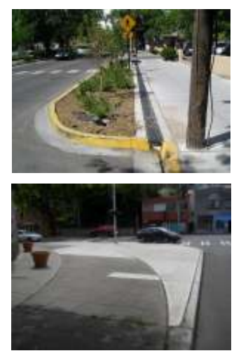
Fig. 1 Curb Extension and Curb Radius Reduction

Curb radius reduction is horizontal intrusion of the curb on the intersection corner, creating a smaller radius, as shown in Figure 5. This measure slows down vehicle right-turn speed due to the tighter corner caused by the smaller radius. It can also improve pedestrian safety by decreasing the crossing distance. Curb radius reduction is acceptable primarily on local roads, but also on collector roadways with inferior extent. In addition, curb radius reductions should not be used on transit routes requiring a right turn (CCL, 2014; PennDoT, 2001).