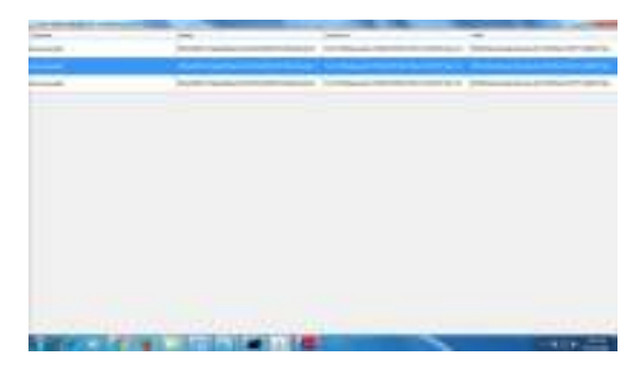
Fig 2:Display The Trust Chart

Our implementation and experiments were developed to validate and examine the overall performance of each the credibility model and the provision model. After uploading the accounts and feedback datasets, in this Application will detects the collusion attacks; Attackers can disadvantage a cloud service by giving multiplemisleading feedbacks giving the feed back at the same time and to detect the Sybil attacks as shown below.