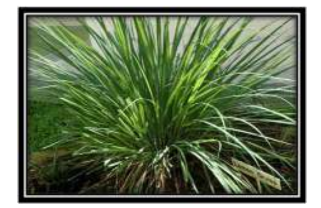
Figure 1: Lemmongrass plant

medicinal plant, including for Lemongrass ( Cymbopogon citratus ), are hydro distillation, steam distillation, solvent extraction (Wang et al. , 2009).