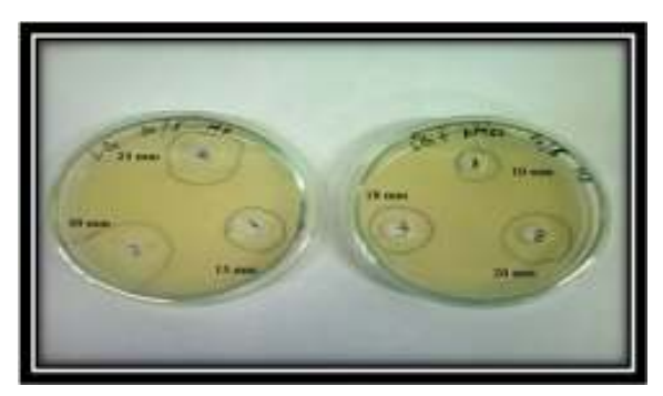
Figure 3: Activity of aqueous and methanolic extract of Lemongrass oil against

Lemongrass oil inhibit the growth of S. aureus and zone of inhibition was occurred for both crude and purified extract the zone of inhibition were 15 mm, 20 mm and 22 mm. and zone of inhibition for crude of Lemongrass oil against P. fluorescens were 15 mm, 25 mm and 30mm. and for purified extract it was 10mm, 18mm and 20mm respectively.(Figure, 2)