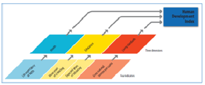
Figure 1: Human Development Index: Indices and Dimensions