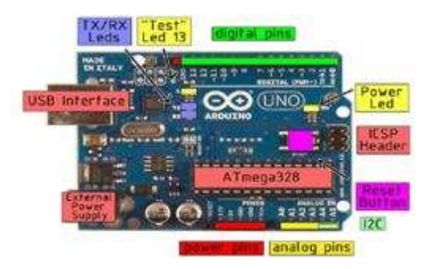
Figure 1: Arduino UNO board

Arduino boards are available commercially in preassembled form, or as do-it-yourself kits. The hardware design specifications are openly available, allowing the Arduino boards to be produced by anyone. Adafruit Industries estimated in mid-2011 that over 300,000 official Arduinos had been commercially produced [6], and in 2013 that 700,000 official boards were in users' hands.[7]