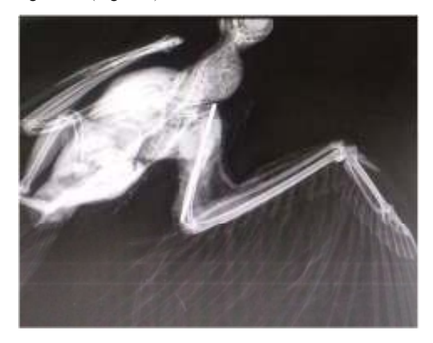
Figure 2: Radiograph after the surgical correction of the fracture

As a part of the pre – operative measure, the area of fracture was clipped, scrubbed and bandaged the rest of the wings. Prior to the surgery the area was aseptically sterilized and an antibiotic umbrella was given. An incision was made on the site of the fracture using BP blade and handle. The fractured bone was exposed. A Steinmann pin 3mm diameter was introduced through the fractured site to the distal part initially and then to the proximal part with the help of a chuck. The remaining part of the pin protruding out from the bone was cut using a pin cutter. The muscle layer was sutured using PGA 2-0, continuous suture pattern and the skin sutured using interrupted suture pattern using hylon. A padding of Staphban ointment was applied and bandaged the area. Radiograph after the surgical correction showed correct alignment. (Figure 2)