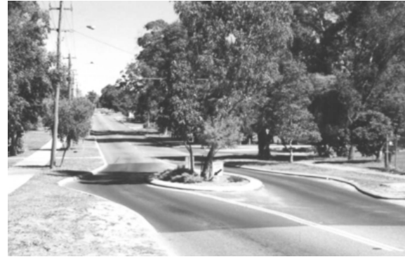
Figure.6: Centre blisters

The islands constructed in the midway of road to restrict traffic speeds are called as Centre blisters as shown in fig.6. These are used for movement of commercial traffic at low speed. The prominent disadvantage of using blister is reduction in space for street parking.