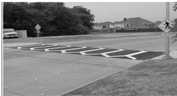
Figure.1: Raised intersections

Raised crosswalks are elongated speed humps that are flat in middle and possess gradient at the sides whereas raised intersections are elevated structures which cover the entire carriageway. Raised intersections and crosswalks are shown in fig.1 and fig.2 respectively.