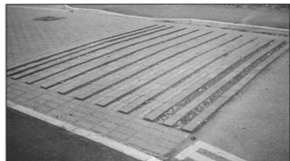
Figure.4: Rumble devices

Rumble devices as shown in fig.4 is a part of road laid with chipped material in form of stripes to caution driver regarding the sudden deep bend ahead in mountainous terrains and on village roads.