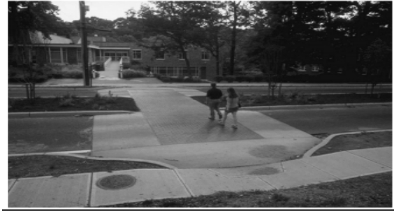
Figure.2: Raised crosswalks