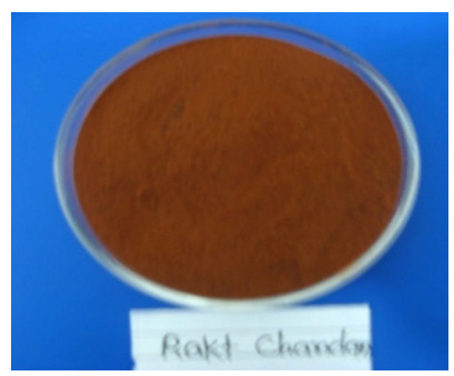
Table 1: Physio-Chemical Parameters of Pterocarpus santalinus L.

In Pterocarpus santalinus L., extract the moisture content of wood (40%), total ash content in wood (7%) acid insoluble ash content was found (0.3), water soluble ash content was (6.4%), Alcohol soluble extract was (23.82%) and total ash was (2%).