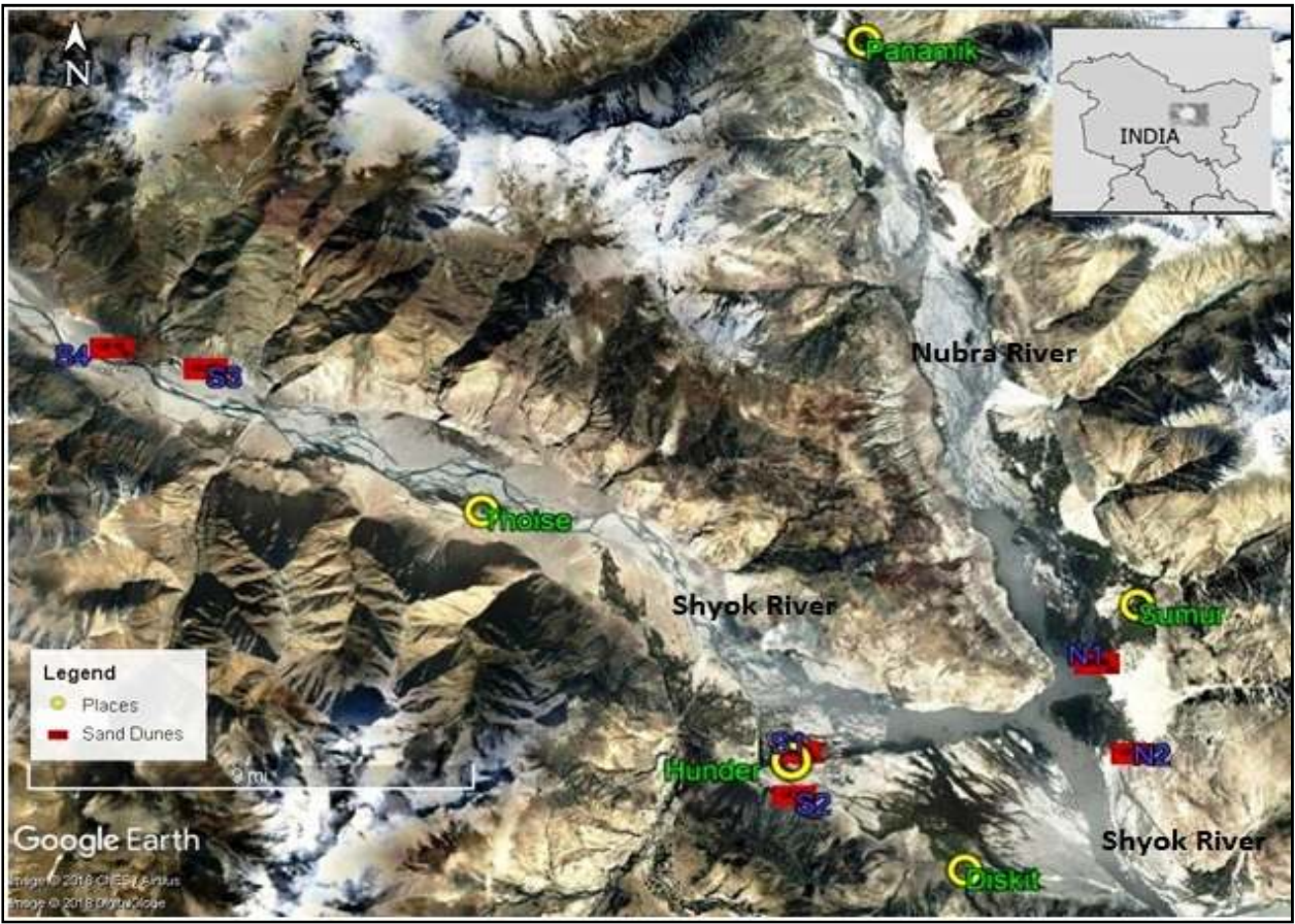
Figure 1: Location of Nubra and Shyok sand dunes on satellite image

the Karakoram ranges from Leh. The Shyok River, a tributary of the Indus River, originates from the Rimo Glacier, one of the tongues of Siachen Glacier.