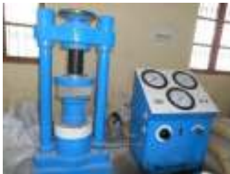
Fig.3. Compressive strength testing machine

Compressive strength is the capacity of a material or structure to withstand axially directed pushing forces, it provides data (or a plot) of force vs deformation for the conditions of the test method. When the limit of compressive strength is reached, brittle materials are crushed. Concrete can be made to have high compressive strength, e.g. many concrete structures have compressive strengths in excess of 50 Mpa, whereas a material such as soft sandstone may have a compressive strength as low as 5 Mpa or 10 Mpa. The Average Compressive Strength of various class block are tabulated in the below Table.4 with compressive strength testing machine in Figure.3.