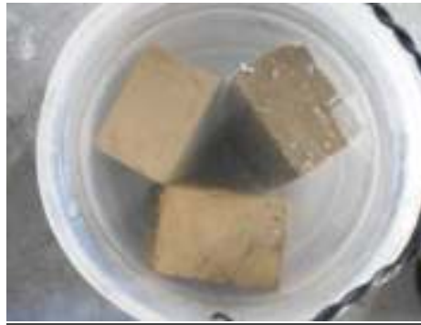
Fig.4. Water absorption Test

Three numbers of whole blocks from the sample are tested, the average water absorption shall not be more than 20% by weight up to class 125 and 15% by weight for higher class.