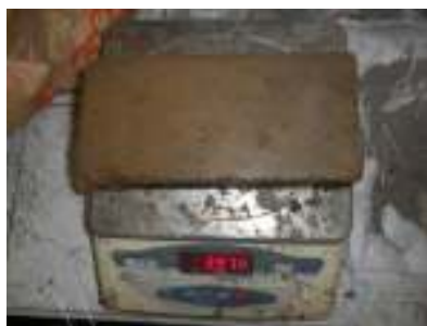
Fig.5.Weighing Process of Plastic & Coir CSSB

In the test for water absorption, the absorption of water in coir added CSSB was found out as 13.66% and the absorption of water in Plastic scrap added CSSB was found out as 10.86%.