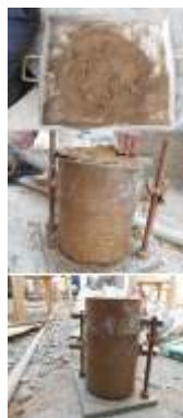
Fig.2. Compaction test

In the test for Standard proctor compaction, shown in below Figure.2, the Optimum moisture content was found out as 12.5%, the maximum dry density of the sample was 2.10 kg/cm 3 , the Void ratio at the maximum dry density was found to be 1.73 and the Porosity at maximum dry density was found to be 0.634. Test details are tabulated in Table. 2 & 3