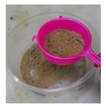
Fig. 3. Sieving technique

This project is classified into 4 phases consisting collecting, mixing, sampling, and analysing.