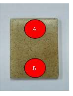
Fig. 6. Sample of sand

B. This technique used Agilent Technologies 85070 measurement software. Before measuring the dielectric properties of the sand sample, calibration is needed to avoid the error occurred during the measurement. Fig. 7. Shows the image of open ended coaxial probe technique.