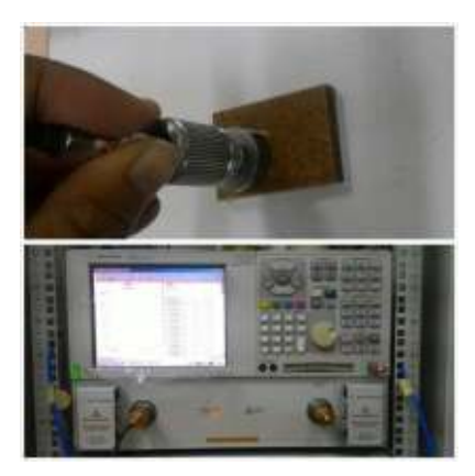
Fig. 7. Open ended coaxial probe technique