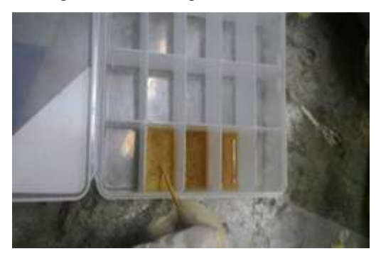
Fig. 5. Square mold of sand

After that, the mixture will be placed into a square mold with size length = 41mm, wide = 27mm, and the thickness is 3mm. The mixture will be left into the square mould for 2 or 3 days in order to ensure the mixture become hardened. Fig. 5. Shows the square mold of sand.