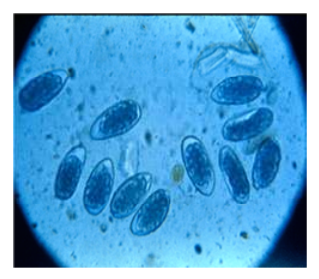
Figure 3: Ova of Strongyle spp. in goat faeces (Microscopic view)