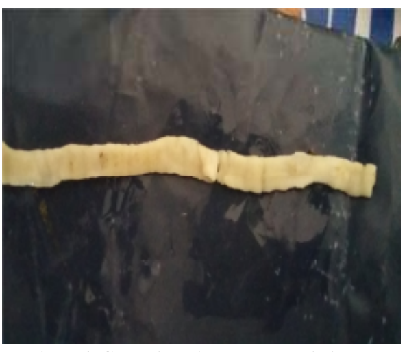
Figure 4: Gastro-intestinal worm Moniezia spp.

the prevalence of each species varies from one region to another as a function of climate, cultural habits, diagnostic resources, and level of notification. On analysing the mean occurrence of parasites with respect to the climatic variations, it was found that the incidence is at its peak during Monsoon (95 percent) season. The incidence was less during Winter Season. Also the parasitic attack was more common among the kids as compared to the adults (Figure 5 and Figure 6).