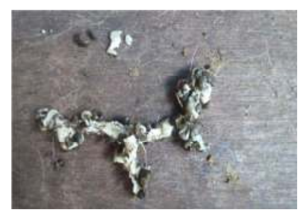
Figure 2: Gastrointestinal parasitic load in goat faecal sample

The overall prevalence of endo-parasites (Figure 2) in the present studied goats was 77.5 percent which is similar to the results obtained in the studies conducted on goats at the hilly regions of Kerala (Gayathri et al., 2017). The various species of endo-parasites encountered during the present investigation have been reported by various researchers in different parts of the world (Gadahi et al., 2009; Nwosu et. al., 2007, Raza et. al., 2007). The present study reveals that the strongyle spp . (Figure 3) infestation is comparatively at its highest when compared to all other infestation observed and hence strongyle parasitism can be integrated to a nutritional disease, because the occurrence of worms usually brings a decrease in appetite, a decreased digestibility of the food and a diversion of nutrients from production sites towards the repair of tissue-damage provoked by the parasites.