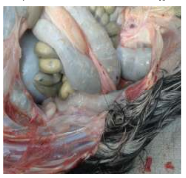
Figure 5: Nodules found on Large intestine of goat due to Oesophagostomum spp. infection ( Post-mortem examination)